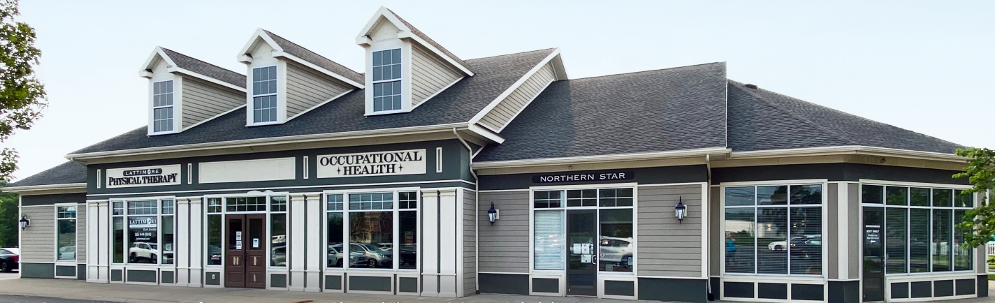
Building B at Erie Station West Henrietta, featuring Lattimore Physical Therapy & Sports Rehabilitation.

Located just south of the New York State Thruway, Erie Station West Henrietta is adjacent to a 185-acre business park and 60-acre residential community. Available spaces range from 2,200 to 20,600 square feet, offering fully customizable interiors and convenient parking in a relaxed and inviting setting. For more information, contact Michael Trojjan at (585) 334-4110 or MTrojjan@KonarProperties.com .