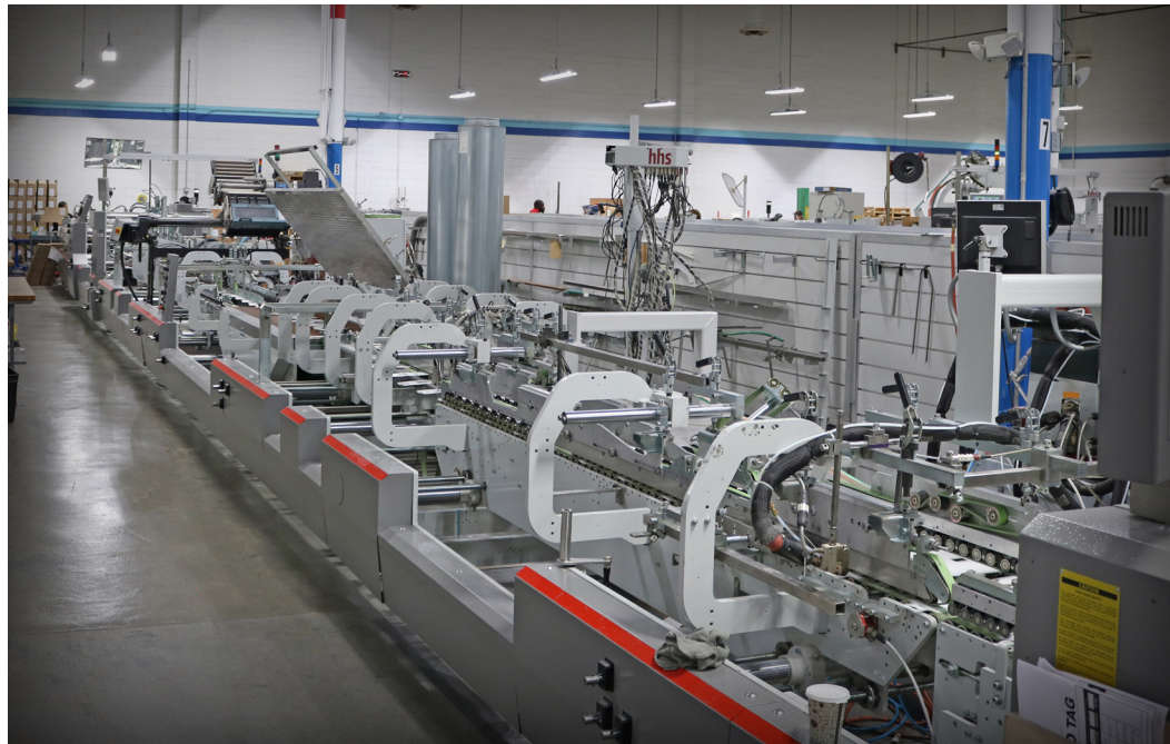
Manufacturing at Diamond Packaging.