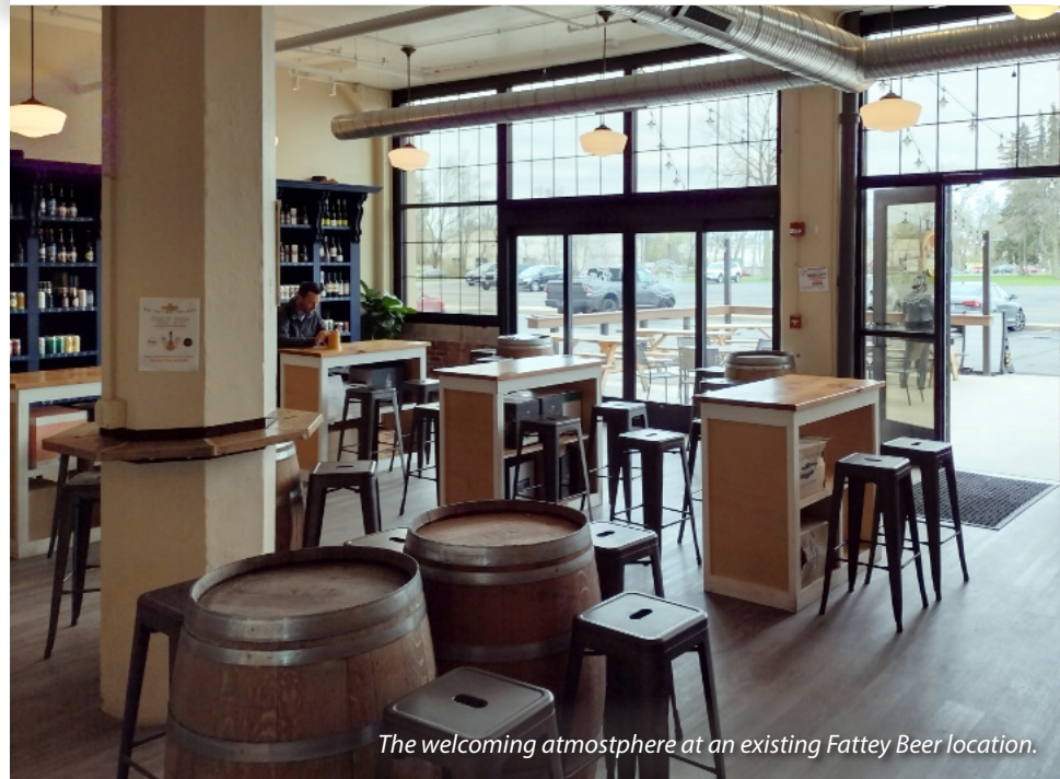
The welcoming atmosphere at an existing Fattey Beer location.

75 Thruway Park Drive West Henrietta, NY 14586